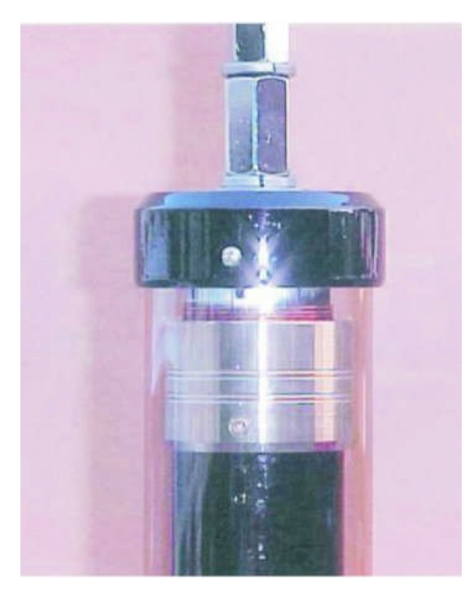
Little Tarheel II in 10 meter position with 32" whip