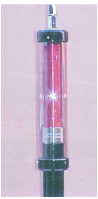
Little Tarheel II in 80 meter position with 32" whip