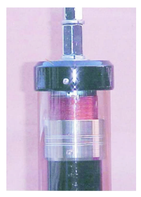
Little Tarheel II in 20 meter position with 32" whip