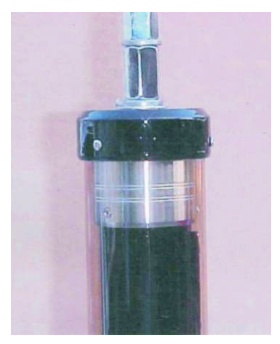
Little Tarheel II in 6 meter position with 32" whip

The following photos will show you relative tuning positions of the Little Tarheel II antenna.