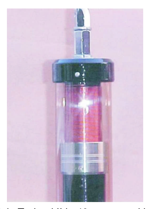
Little Tarheel II in 40 meter position with 32" whip