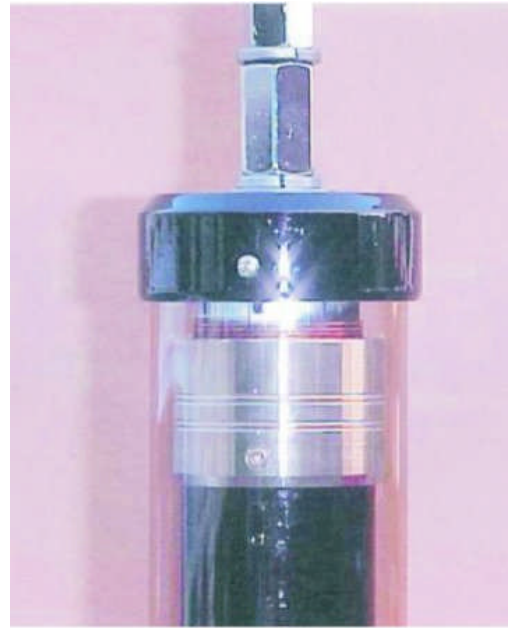
Little Tarheel II in 10 meter position with 32" whip