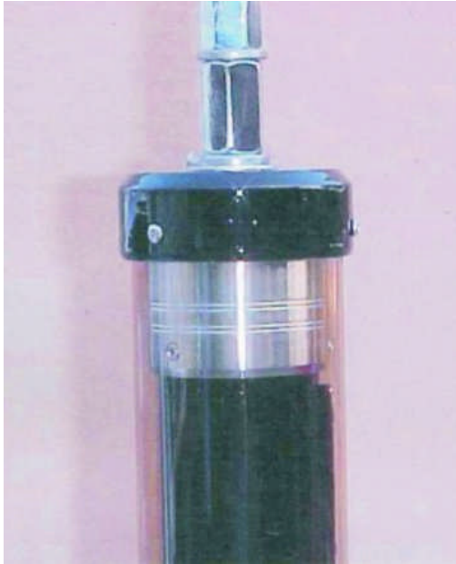
Little Tarheel II in 6 meter position with 32" whip

The following photos will show you relative tuning positions of the Little Tarheel II antenna.