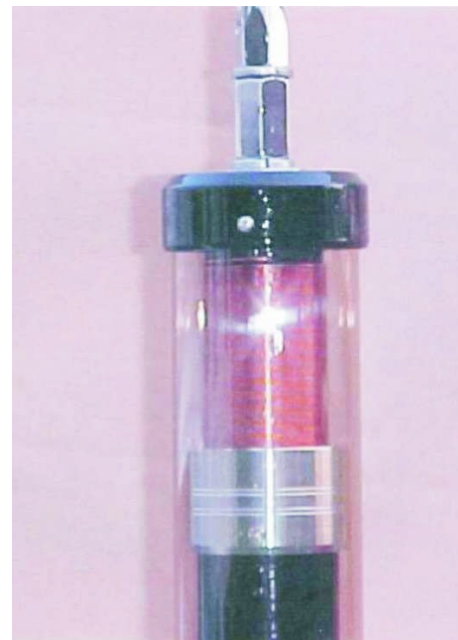
Little Tarheel II in 40 meter position with 32" whip