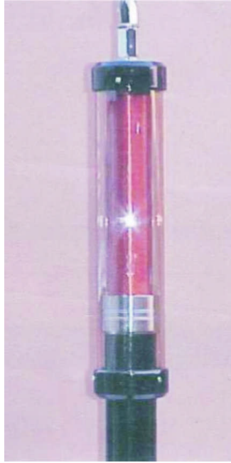
Little Tarheel II in 80 meter position with 32" whip