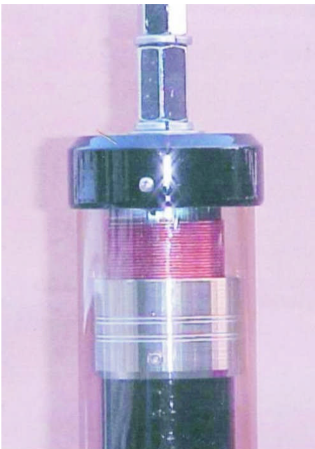
Little Tarheel II in 20 meter position with 32" whip